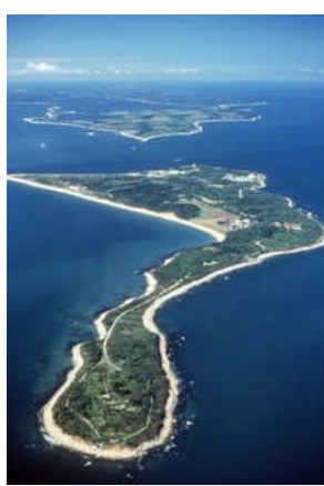
In this undated photo released by the Agricultural Research Service of the U.S. Department of...